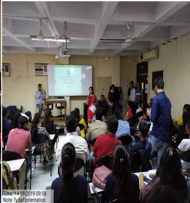
Time: 14-09-2019 09:58 Note: fy baf orientation