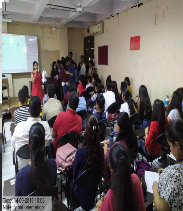
Time: 14-09-2019 10:06 Note: fy baf orientation