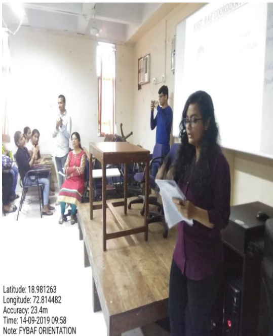
Latitude: 18.981263 Longitude: 72.814482 Accuracy: 23.4m Time: 14-09-2019 09:58 Note: FYBAF ORIENTATION