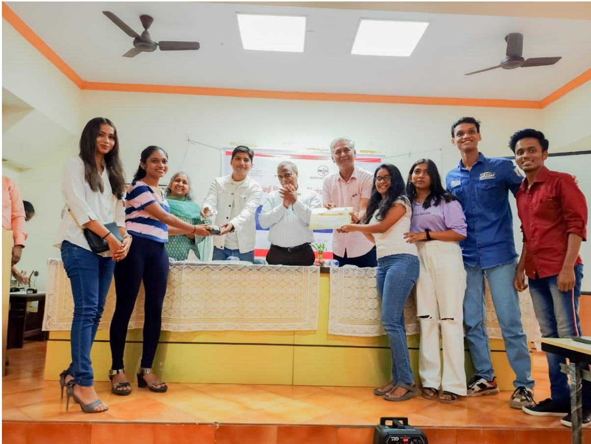
4. Felicitation of Blood Donation Motivators during Covid – 19 at Railway Stations - NSS

E-mail: lcolcom@mtnl.in | principal.llc@gmail.com | website: www.lalacollege.edu.in